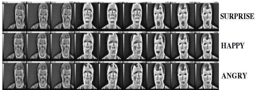
Figure 2: Sample images of three different people, showing the three poses used for each facial expression. From top to bottom: Surprise, Happy and Angry.