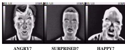
Figure 6: All images in the figure appear to be “Happy” but are not labeled as such in the data set.

per facial feature into three regions of membership: “surprise”, “happy” and “angry”. Consequently our Testing setup is primarily concerned with showing system FER performance under two different criteria: 1) Being able to correctly locate and label image features, and 2) its ability to cope with partial facial occlusions.