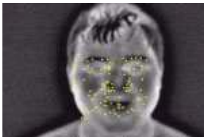
Figure 4: Interest points detected on a person's face. Most of them are grouped around the eyes, mouth and nose.