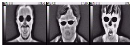
Figure 7: Example images of people with glasses.